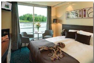
Cabin Category 2

The English-speaking, international crew provides warm hospitality. The M.S. AMADEUS ELEGANT meets the highest safety standards and is one of the only European river ships to have been awarded the "Green Globe Certification" of environmental preservation.