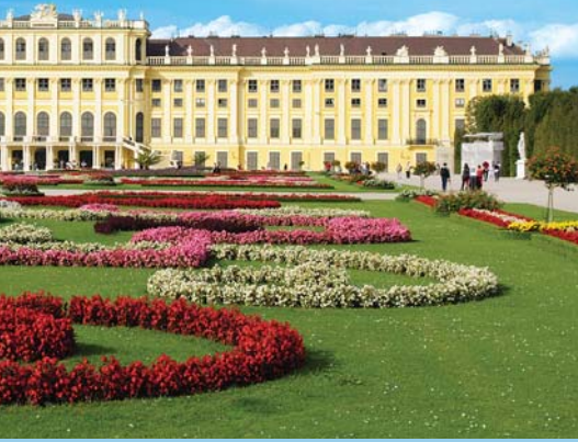
Palace, a UNESCO World Heritage site, residence and Antoinette to Emperor Franz Josef.