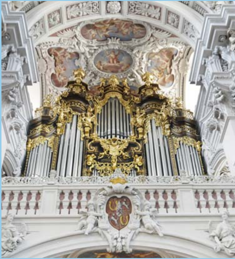
The highest and lowest tones played by the pipe organ in St. Stephan's Cathedral are nearly inaudible to humans.

designated a UNESCO World Heritage site. Tour this remarkable city, which owes its present appearance to the Austro-Hungarian Emperor Franz Josef, who created the famous Ringstrasse to showcase the city's finest landmarks—the impressive Vienna Opera House and the lavish Hofburg Palace. Visit Gothic Stephansdom (St. Stephan's Cathedral) followed by a performance of Mozart's music in a premier venue.