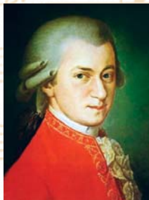
Wolfgang Amadeus Mozart

Since the 18 th century, the lands encompassing the Danube River Valley—Austria, Hungary and Germany—and the Czech Republic have bequeathed to the world an unparalleled musical legacy. The 1700s saw the creative genius of Johann Sebastian Bach, Franz Josef Haydn and