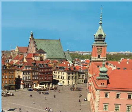
Warsaw City Centre.

Pre-Program and Post-Program Options are available at additional cost. Details will be provided with your reservation confirmation.