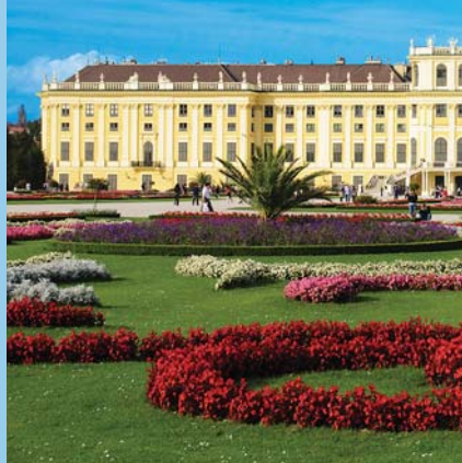
Admire the rococo grandeur of Schönbrunn playground of Habsburg royalty from Marie

See St. Vitus Cathedral; view original Beethoven manuscripts in Lobkowitz Palace in Prague Castle and enjoy a specially arranged, private string quartet concert of the composer's works; then, walk through the "Golden Lane," a street formerly lined with goldsmiths that today is known for its small houses built in the Mannerist style at the end of the 16 th century.