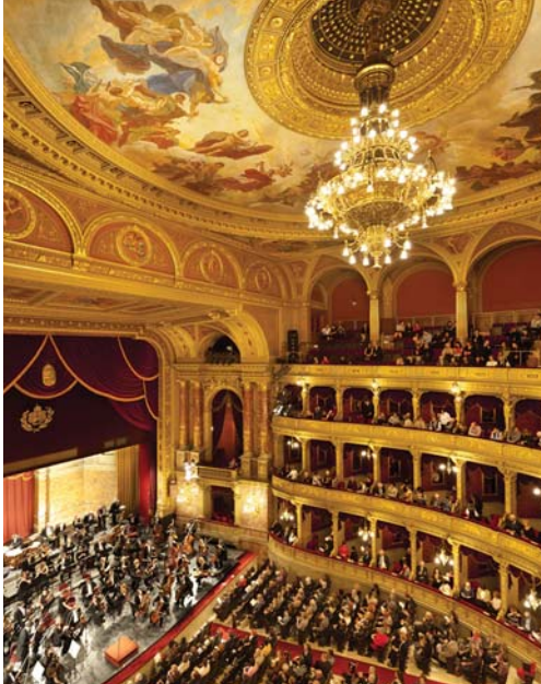
Budapest's State Opera House is considered one of architect Miklós Ybl's masterpieces and its acoustics are still among the best in the world.

UBC ALUMNI ASSOCIATION DISCLAIMER: The University of British Columbia Alumni Association will not be responsible for the financing, the arranging, or the conducting of these tours. They assume no liability or responsibility for damages or financial loss to person howsoever arising from the negligence, omission or otherwise of travel services arranged through travel suppliers. Refer to the General Terms and Conditions established below with respect to participating in these tours.