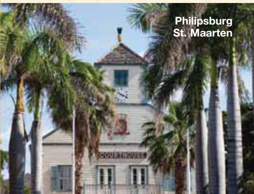
Philipsburg St. Maarten

**FREE AIRFARE is available from Des Moines, Fargo, Lubbock, Milwaukee, Saskatoon, Spokane, Tucson and Tulsa; however, due to the limited flight schedule, overnight stays may be required at the traveller's expense.