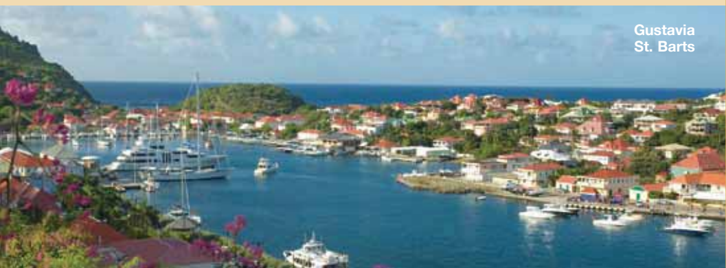
Gustavia St. Barts